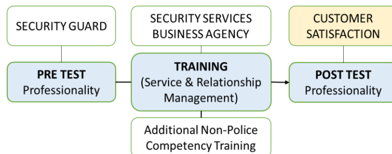
Figure 1. Scheme of thinking and research flow

The population in this study took a sampling of 40 employees in the security sector from 2 security service companies or security service business entities (BUJP) PT. DAS and PT. VIP in Surabaya, which places several employees from the security unit (Satpam) who have taken additional training beyond the technical and professional training material provided by the Directorate of Education and Security Development of the East Java Regional Police (POLDA). Security guards who receive additional training, in the form of soft skills material (knowledge and character) and hard skills (work attitudes and behavior) which are packaged in the customer relationship communication training material are the security guards selected to be placed in banking institutions, places of worship and markets. in Surabaya. The reason for choosing this sampling was based on the consideration that security guards who have undergone official training, apart from receiving a certificate from the National Police, as carrying out limited police functions, have increasingly important duties (Kurniawan et al., 2022), namely as the front guard for security, especially in companies or agencies, especially security guards who have received additional coaching and training (Billa, 2023). The research design can be described in the following scheme.